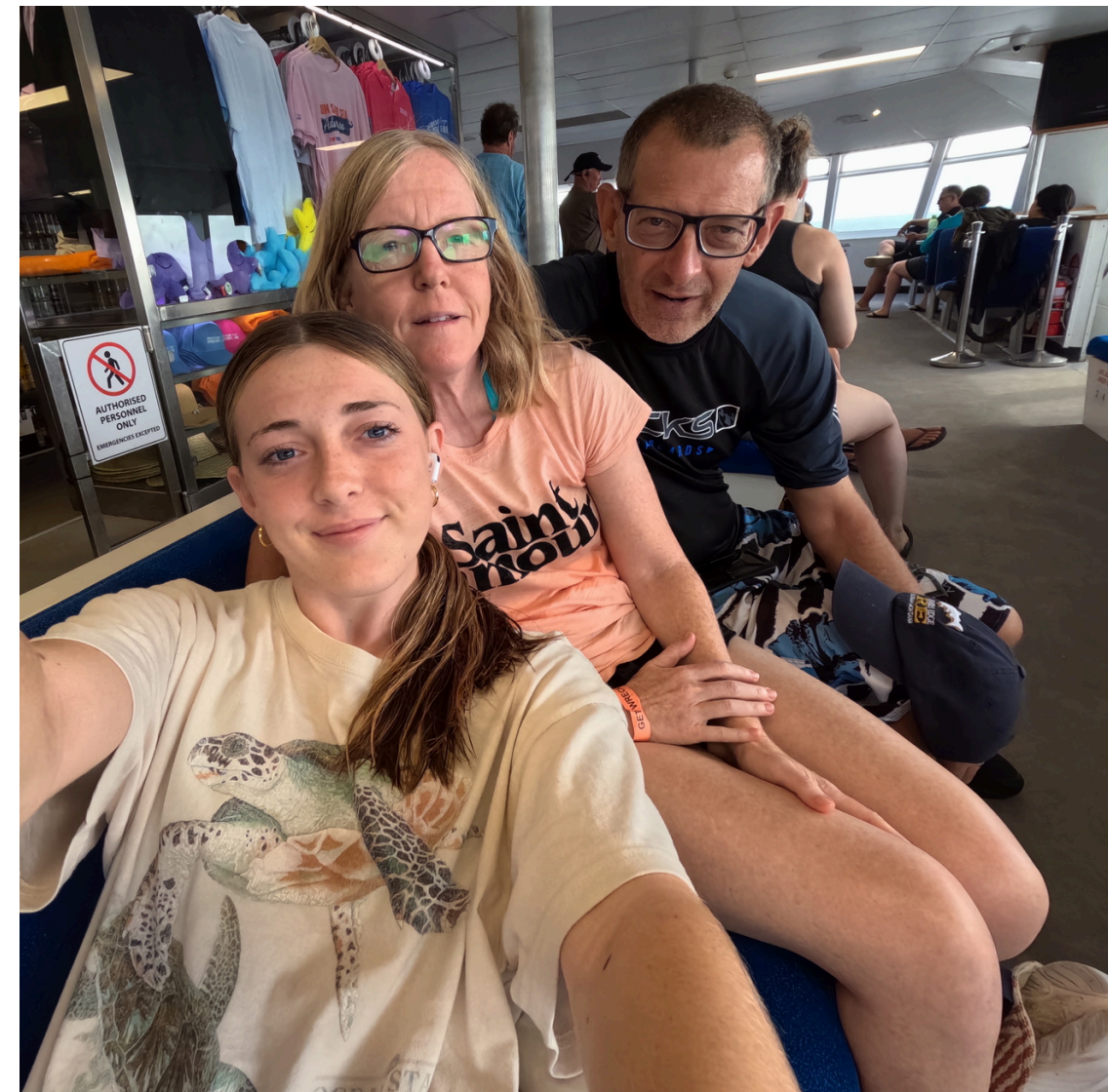
ÄITI JA ISÄ