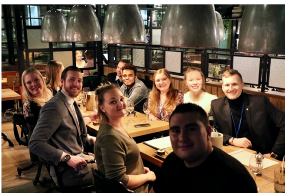
Rotaractors from around Finland had fun during the days and the nights.